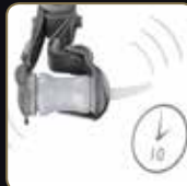
C: Mix for 10 seconds.