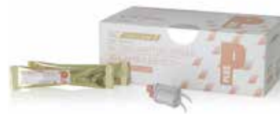
GC Gold Label PLUS CAPSULE Box 30 capsules (0.19mL each)