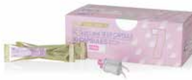
GC Gold Label VII EP CAPSULE Box 30 capsules (0.13mL each) Shades Pink, White