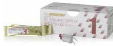
GC Gold Label I CAPSULE Box 30 capsules (0.19mL each)