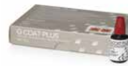
G-COAT PLUS 4mL