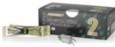
GC Gold Label II LC CAPSULE Box 30 capsules (0.10mL each) Shades A1, A2, A3, A3.5, A4