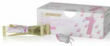
GC Gold Label VII CAPSULE Box 30 capsules (0.13mL each) Shades Pink, White