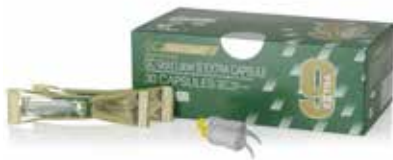
GC Gold Label IX EXTRA CAPSULE Box 30 capsules (0.14mL each) Shades A2, A3, A3.5