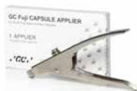
GC CAPSULE APPLIER III