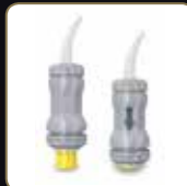
B: Depress plunger, hold down 2 seconds.