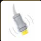
A: Shake or tap to loosen powder.