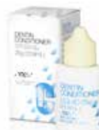
DENTIN CONDITIONER 25g (23.8mL)