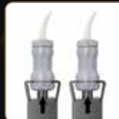
D: Two clicks to prime capsule then syringe slowly.